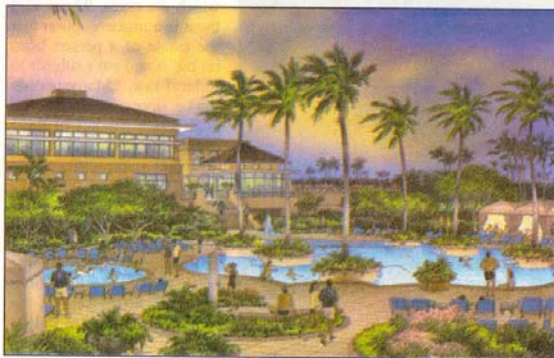
Artist's rendering of the clubhouse at Costa Caribe Resort Golf Club & Country Club

Costa Caribe's master plan calls for an $80 million investment in additional facilities, including 100 more villas and 100 timeshare units within two or three years, said Mainka. ■